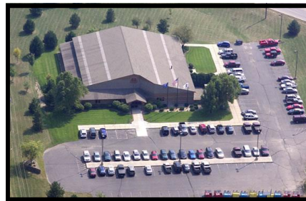
Aerial photograph of the Elkhart County, IN Department of Public Services building